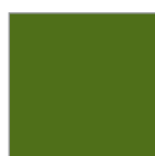
28 ●●● Vert mousse Moss green