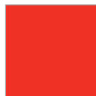
101 ●●● Orange vif Vivid orange