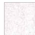
204 ●●● Diamant Diamond