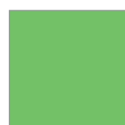
27 ●●● Vert lumière Light green