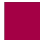
23 ●●● Rouge d'orient Oriental red