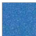
201 ● Aigue-Marine Aquamarine