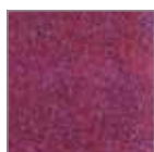
207 ● Tourmaline