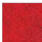
203 ●● Rubis Ruby