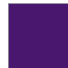
29 ●●● Violet parme Parma violet