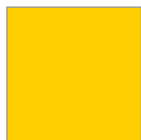
13 ●●● Bouton d'or Buttercup