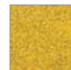
208 ●●● Or Gold