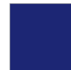
12 ●●● Bleu outremer Ultramarine blue