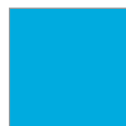
35 ● Bleu fluo Fluorescent blue