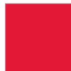
24 ●●● Rouge cardinal Cardinal red