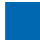
11 ●●● Bleu cobalt Cobalt blue