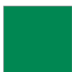
04 ● Vert prairie Lawn green