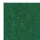
202 ●● Émeraude Emerald