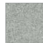
209 ●●● Argent Silver