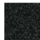
205 ●●● Onyx