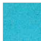
206 ● Turquoise