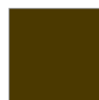
14 ●●● Brun velours Velvet brown